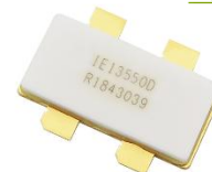
Package Type : RF24001DKR3